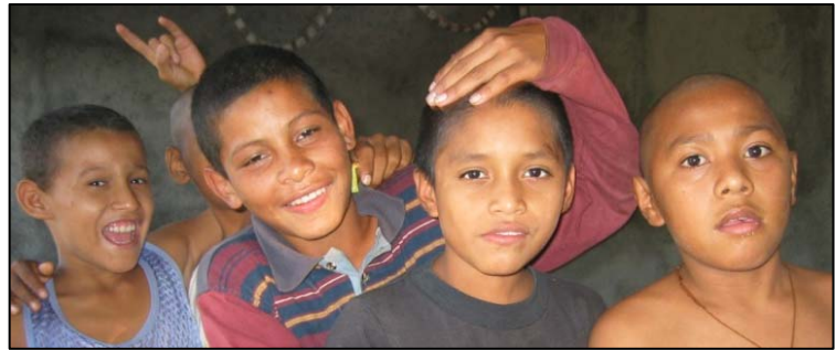
Many faces, many lives